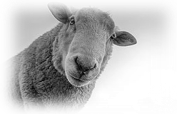
Ewes in charge?