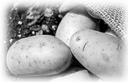
Ready to make 'baked taters'

The 'taters (potatoes) were still in the ground. Grandad had grown them, but if dad wanted any, he would have to dig them up himself.