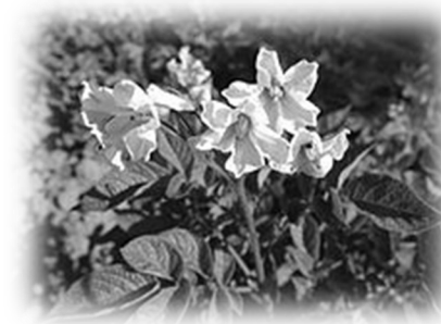
Potatoe Plant (Solanum tuberosum)

But oh what luck I get with things I never even planted!