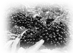
Elderberries (Sambucus berries)