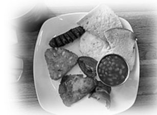
Cooked breakfast (coctum prandium)